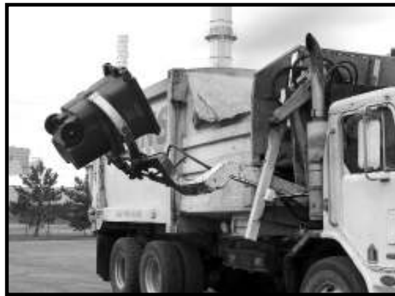
Driver does not get out of the truck.

Visit our website at www.johnsdisposal.com