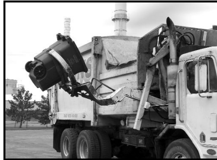
Driver does not get out of the truck.

Visit our website at www.johnsdisposal.com